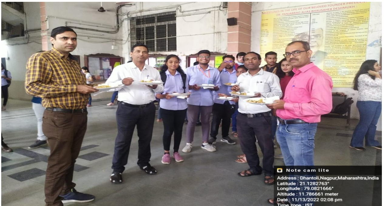
Staff & Students from Computer Science Department